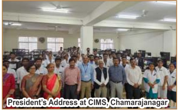
President's Address at CIMS, Chamarajanagar