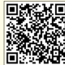
IMA KSHS APPLICATION FORM