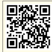
IMA KPSS APPLICATION FORM