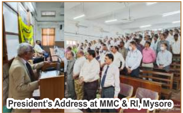
President's Address at MMC & RI, Mysore