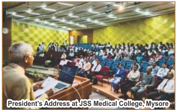
President's Address at JSS Medical College, Mysore