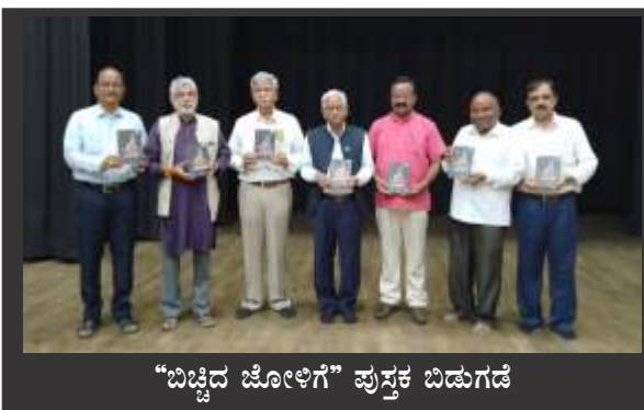
"ಬಿಚ್ಚಿದ ಜೋಳಿಗೆ" ಪ್ರಸ್ತುತ ಬಿಡುಗಡೆ