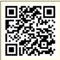
IMA KSB APPLICATION FORM